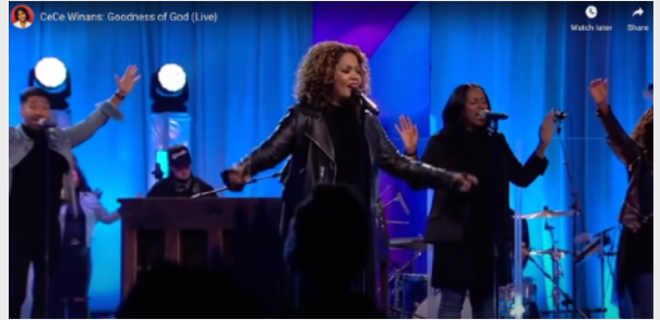
"Goodness of God" sung by CeCe Winans